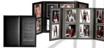
Image folios contain 8 or 12 4x5 images in a leather folio. With any collection order, the 8-view is $100 and the 12-view is $150 when placed within the first seven days. Individually, the 8-view folio is $200 and the 12-view folio is $300. Basic retouching is included on all of the folio images.

Our custom photo books are a great keepsake of your senior session. They are available in soft or hard cover and are individually created by our album designers for a unique collectable look and feel. Each booklet incorporates text as well as images - be sure to let us know your favorite sayings and what your school mascot is.